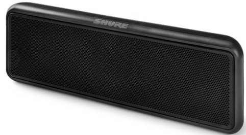
MXP-3B Wall Mount Conferencing Loudspeaker BLACK